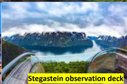
Stegastein observation deck