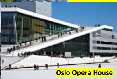
Oslo Opera House