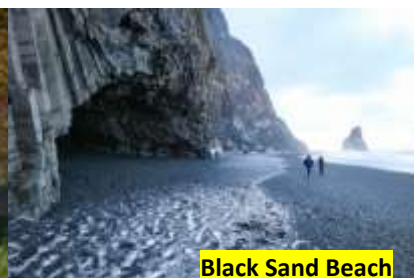
Black Sand Beach