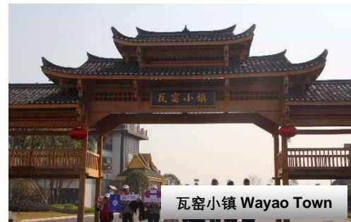
瓦窑小镇 Wayao Town