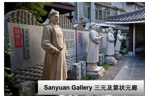
Sanyuan Gallery 三元及第状元廊