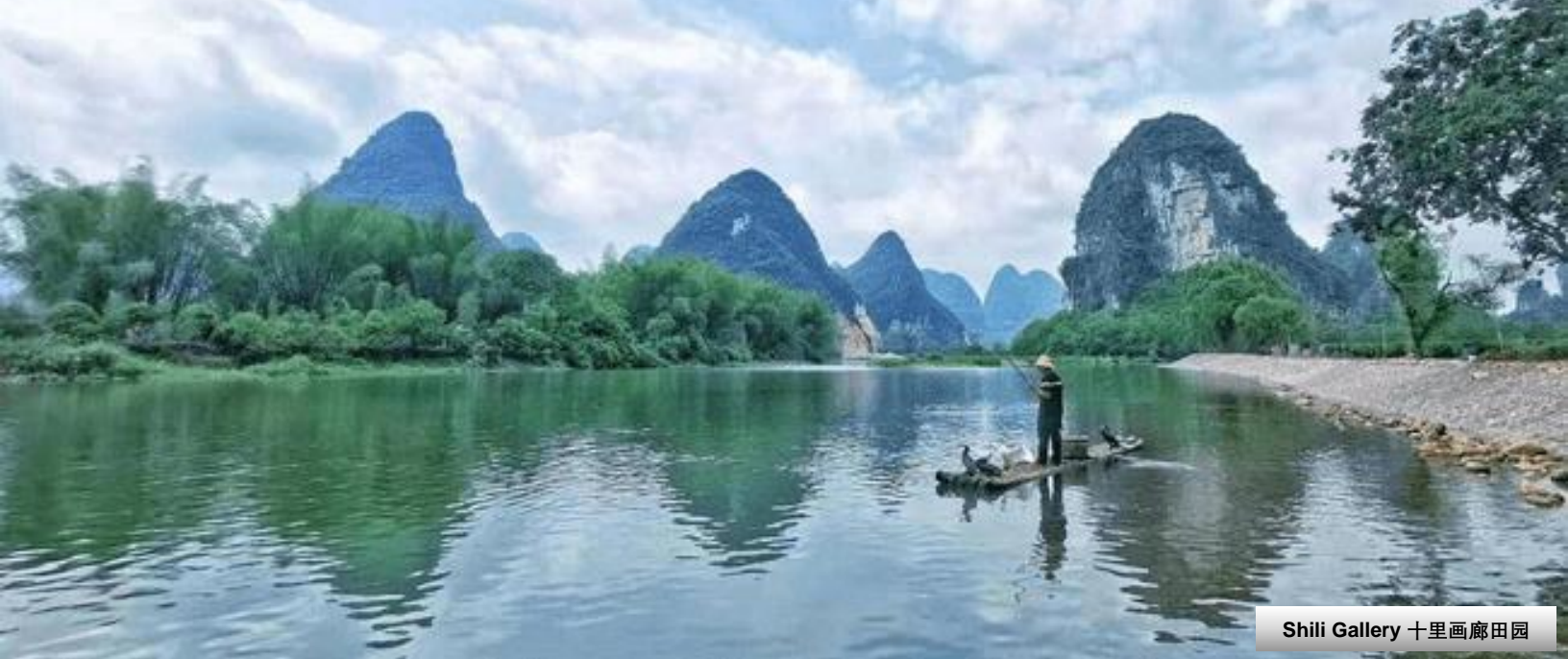
Shili Gallery 十里画廊田园