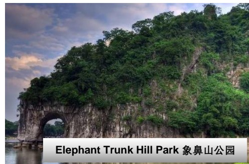
Elephant Trunk Hill Park 象鼻山公园