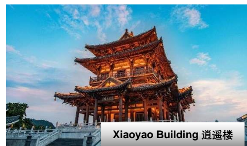
Xiaoyao Building 逍遥楼