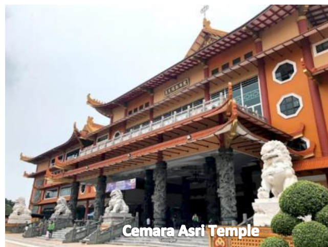
Cemara Asri Temple

Breakfast at hotel, transfer to airport for flight home.