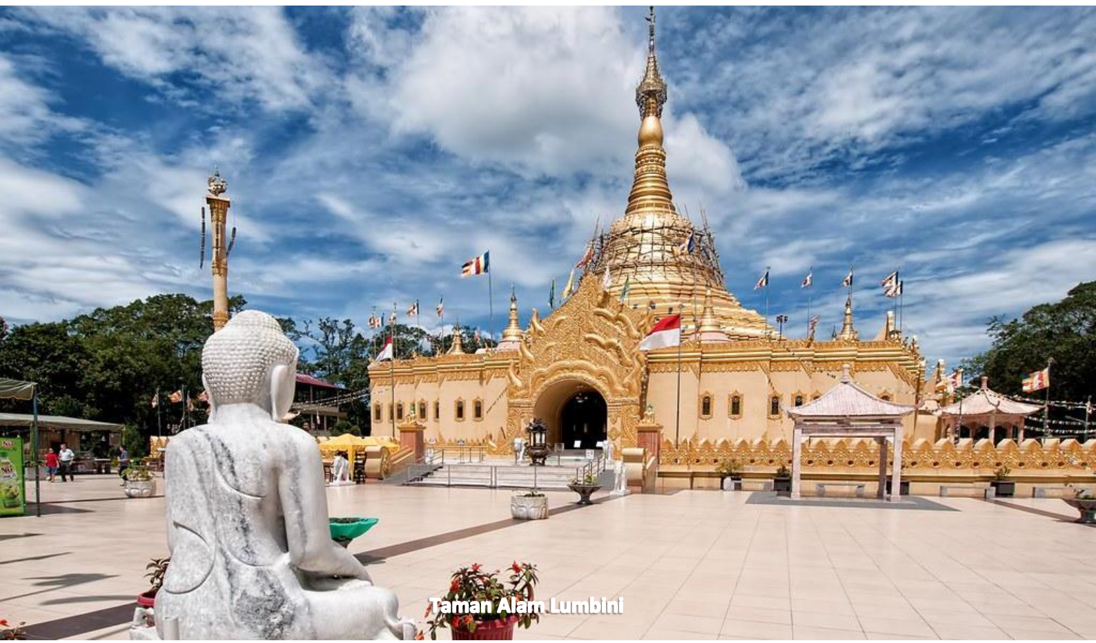
Taman Alam Lumbini

Taman Alam Lumbini was inspired from Shwedagon Pagoda in Myanmar. The project was successfully completed in 2010 with the scale for 46.8 meters in height, 68 meters in length, 68 meters in width. It is the second highest among the other pagoda outside from the Union Republic of Myanmar.