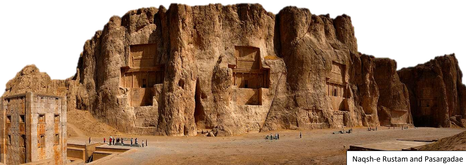
Naqsh-e Rostam and Pasargadae

早餐后, 驱车前往古伊朗首都的波斯波利斯(世界遗产), 阿契美尼德建筑的宏伟杰作。然后参观纳克什鲁斯塔姆和帕萨尔加德(世界遗产), 这是一个在千色传说和神话中永远俘获了居鲁士国王的地方。然后继续开车前往伊斯法罕。