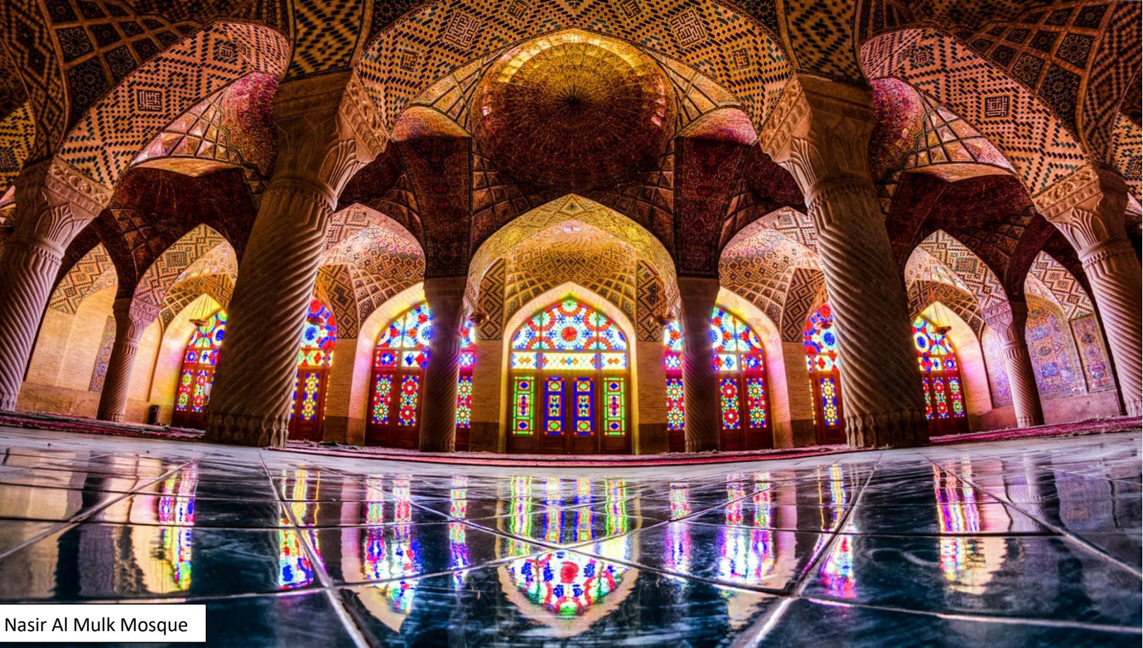
Nasir Al Mulk Mosque