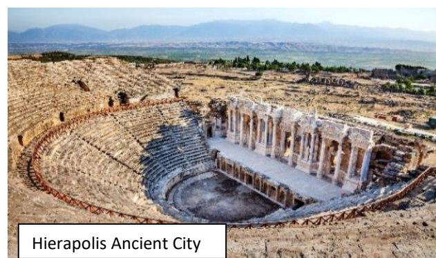
Hierapolis Ancient City