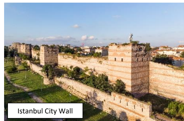
Istanbul City Wall