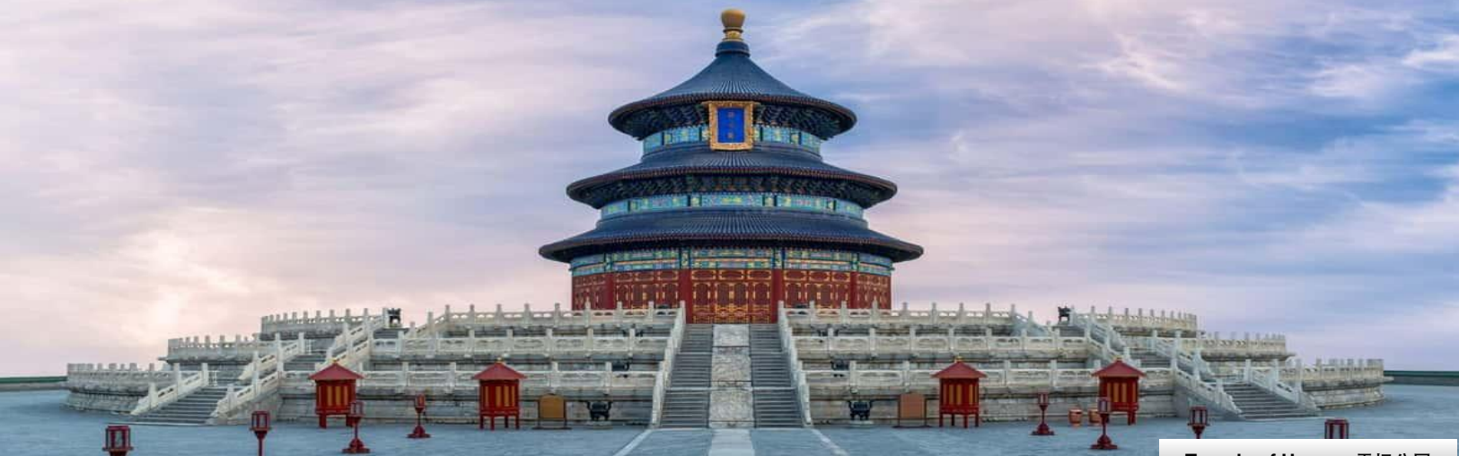
Temple of Heaven 天坛公园