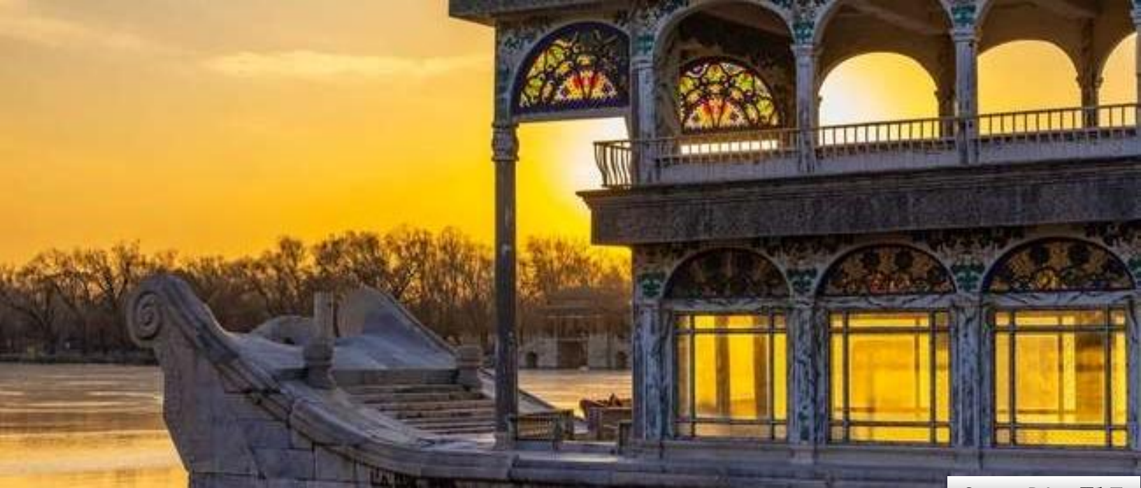
Summer Palace 颐和园