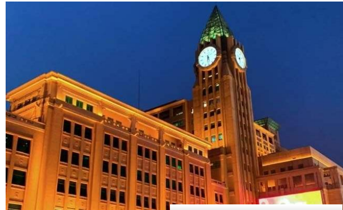
Wangfujing Street 王府井大街