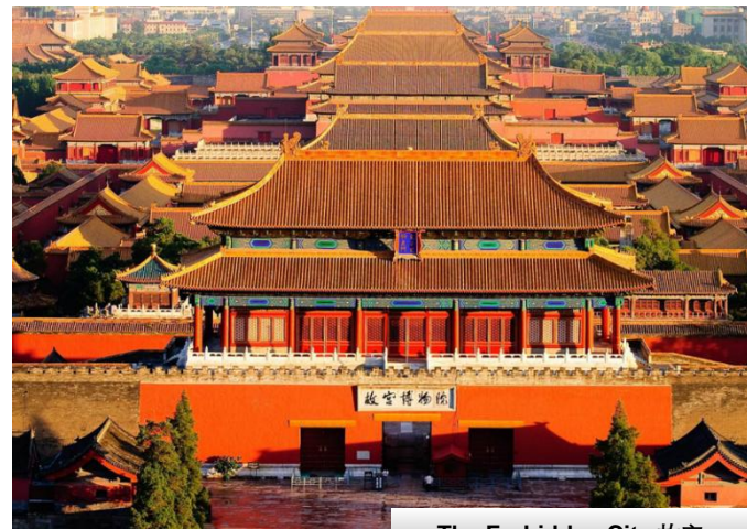
The Forbidden City 故宫