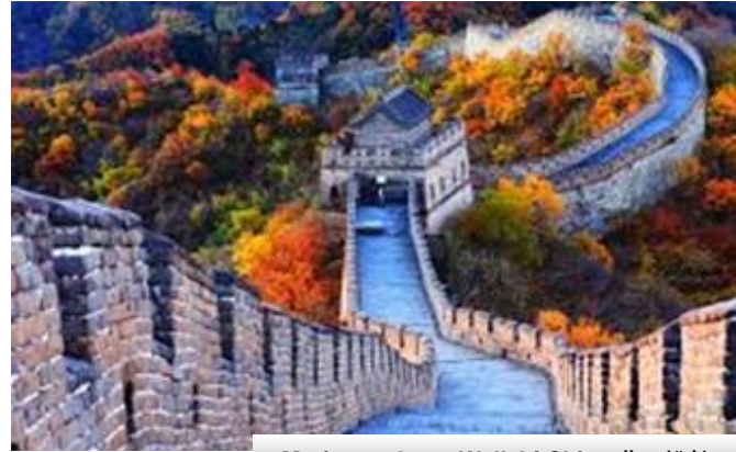
Mutianyu Great Wall Of China 慕田峪长城