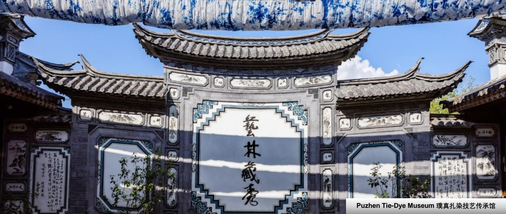
Puzhen Tie-Dye Museum 璞真扎染技艺传承馆