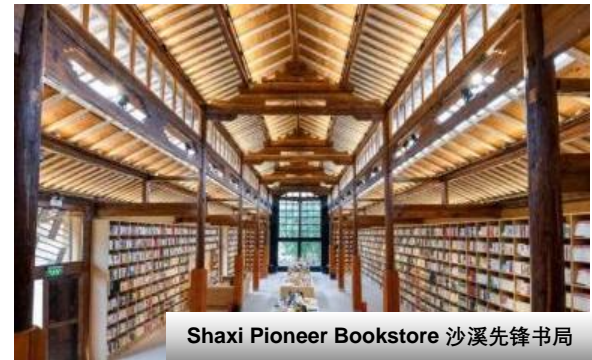
Shaxi Pioneer Bookstore 沙溪先锋书局