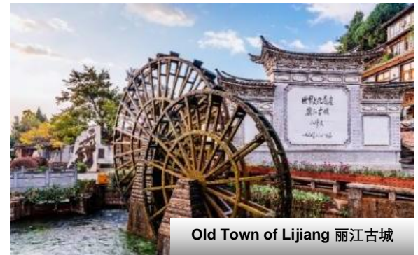
Old Town of Lijiang 丽江古城