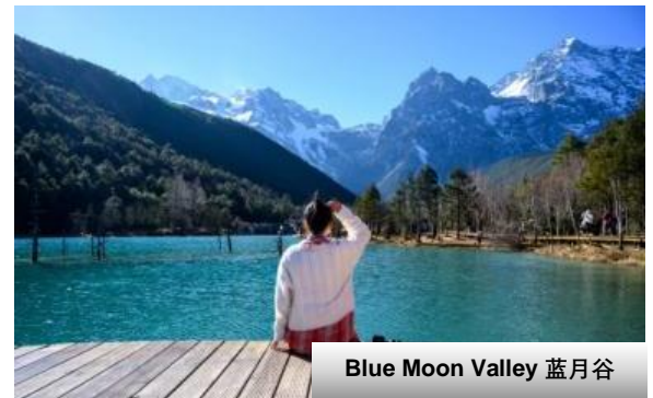
Blue Moon Valley 蓝月谷